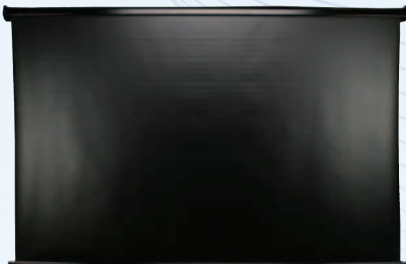
Black-Backed Screen Material

Elite Screens stocks all sizes from 71" to 150" in 1:1, 4:3 and 16:9 aspect ratios. Choose from MaxWhite™ or SilverGrey material options with a white or black metallic casing option.